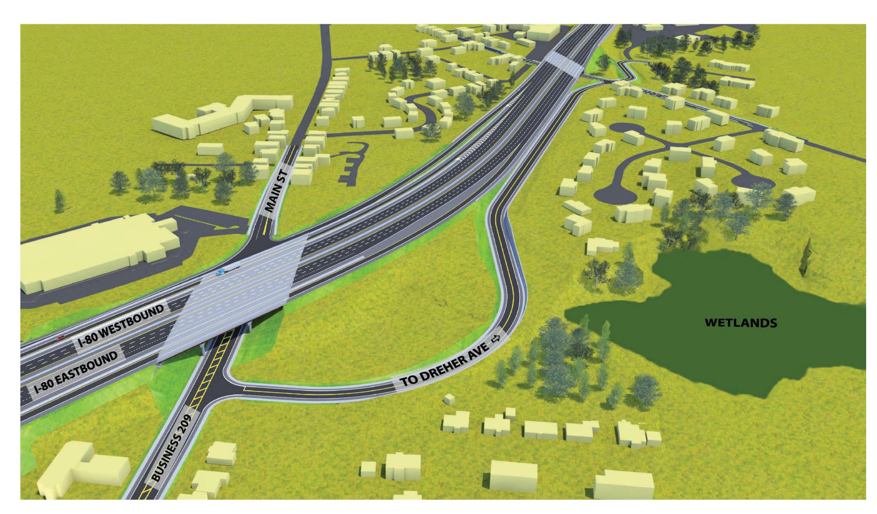
Looking East at the Proposed Dreher Avenue Connector Looking West at the Proposed 307 Interchange