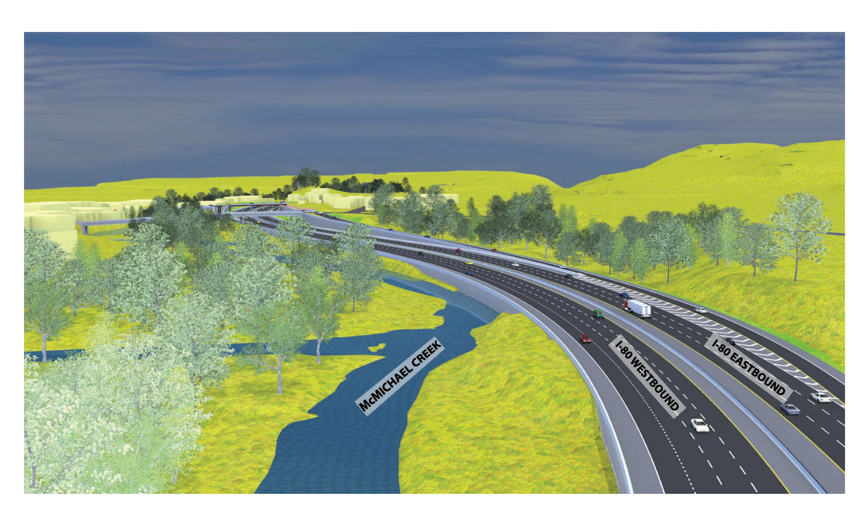
Looking East at the Retaining Wall Along McMichael Creek