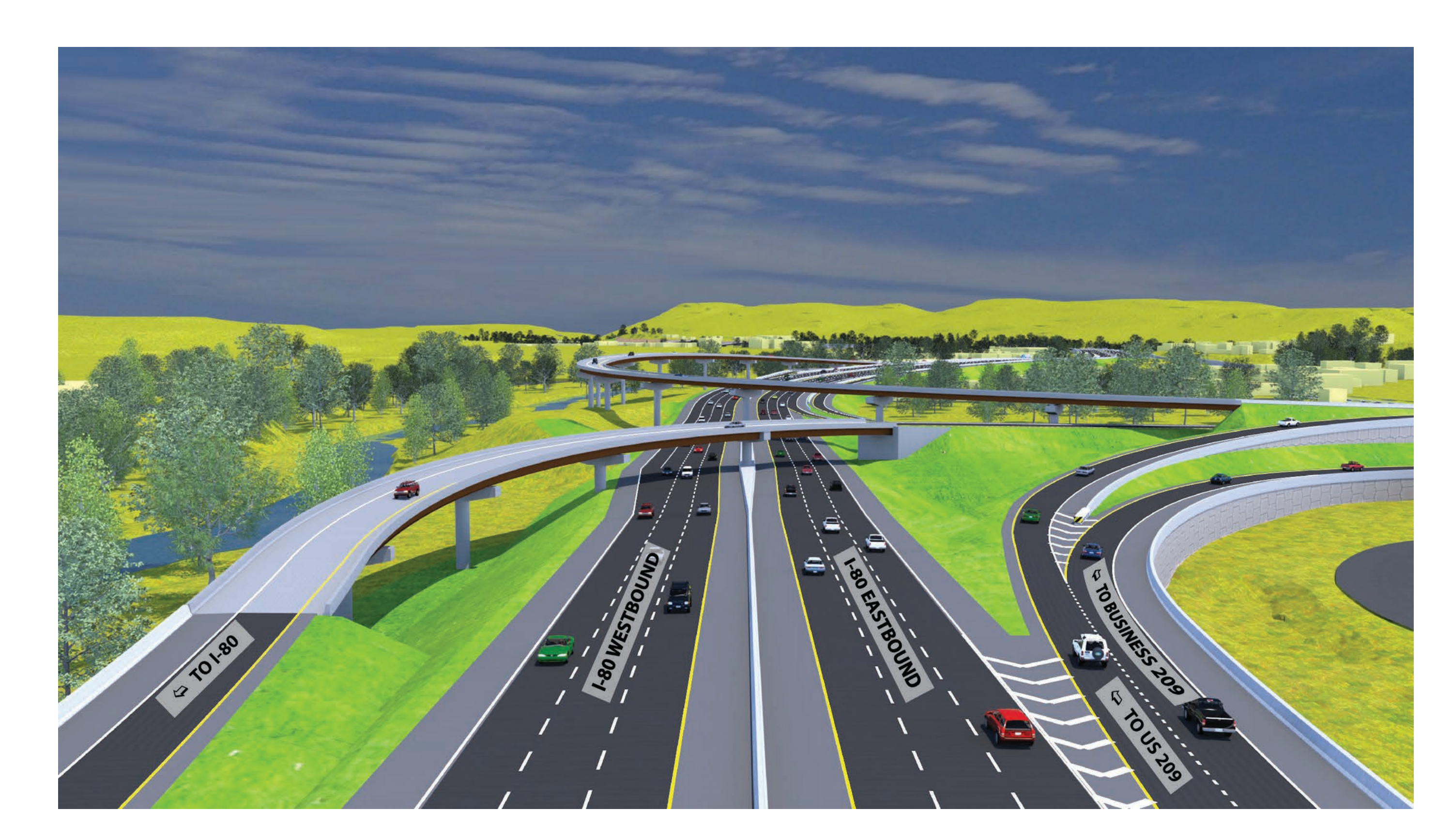
Looking East at the Proposed 304 Interchange