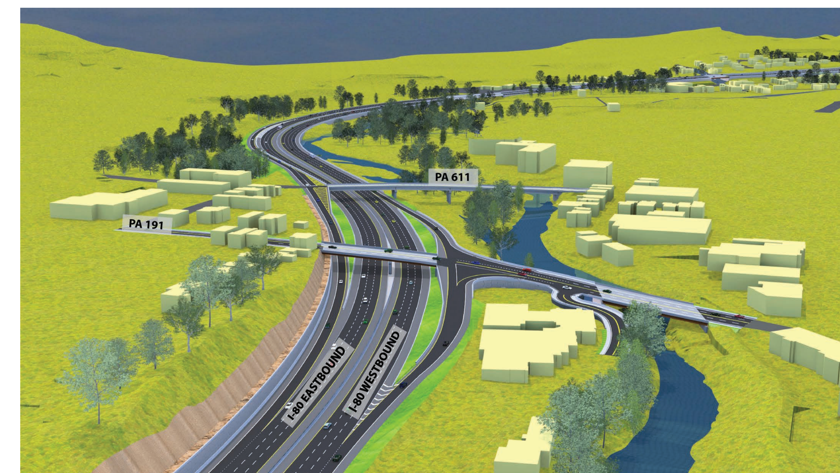
Looking West at the Proposed 307 Interchange