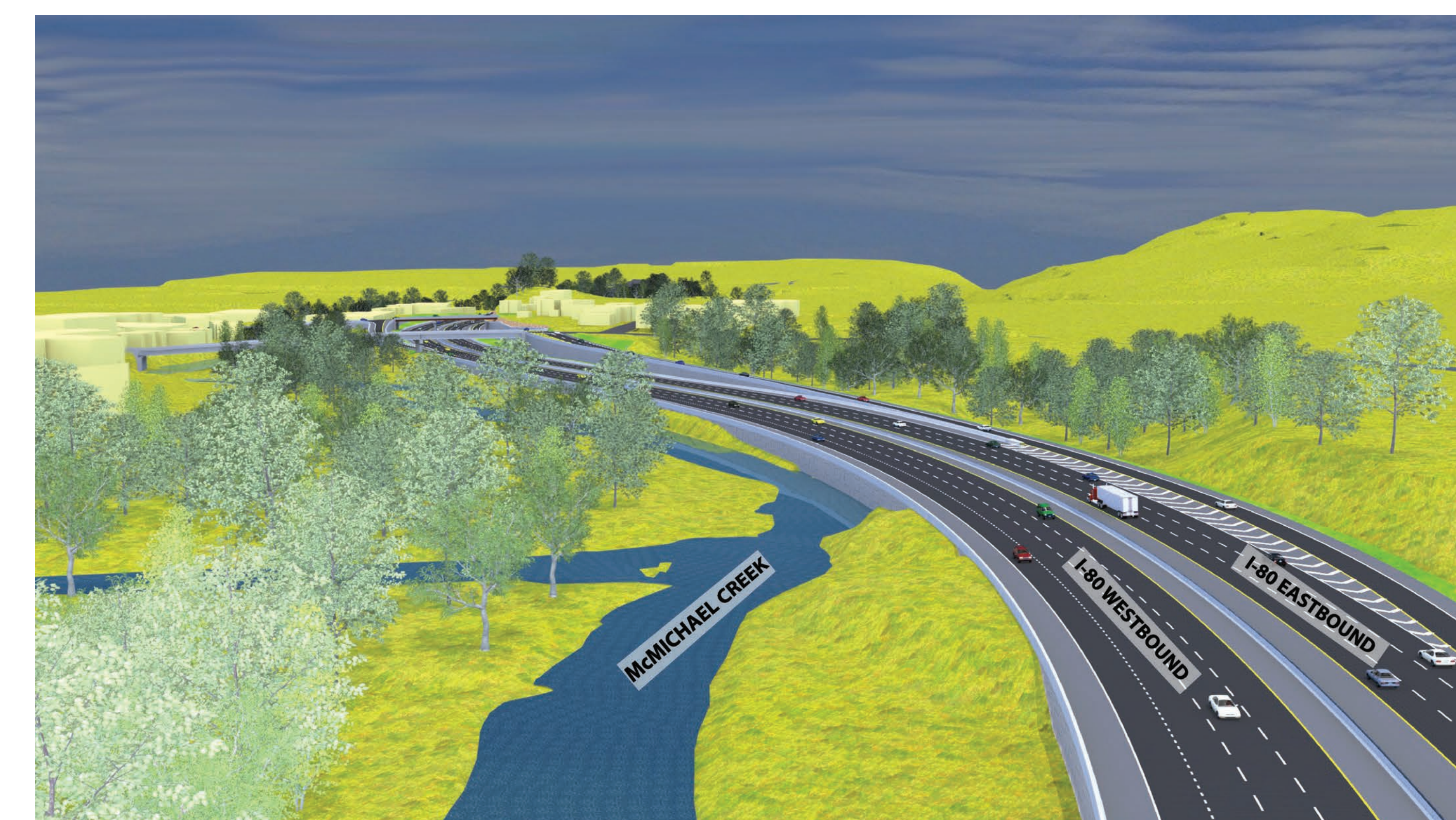
Looking East at the Retaining Wall Along McMichael Creek