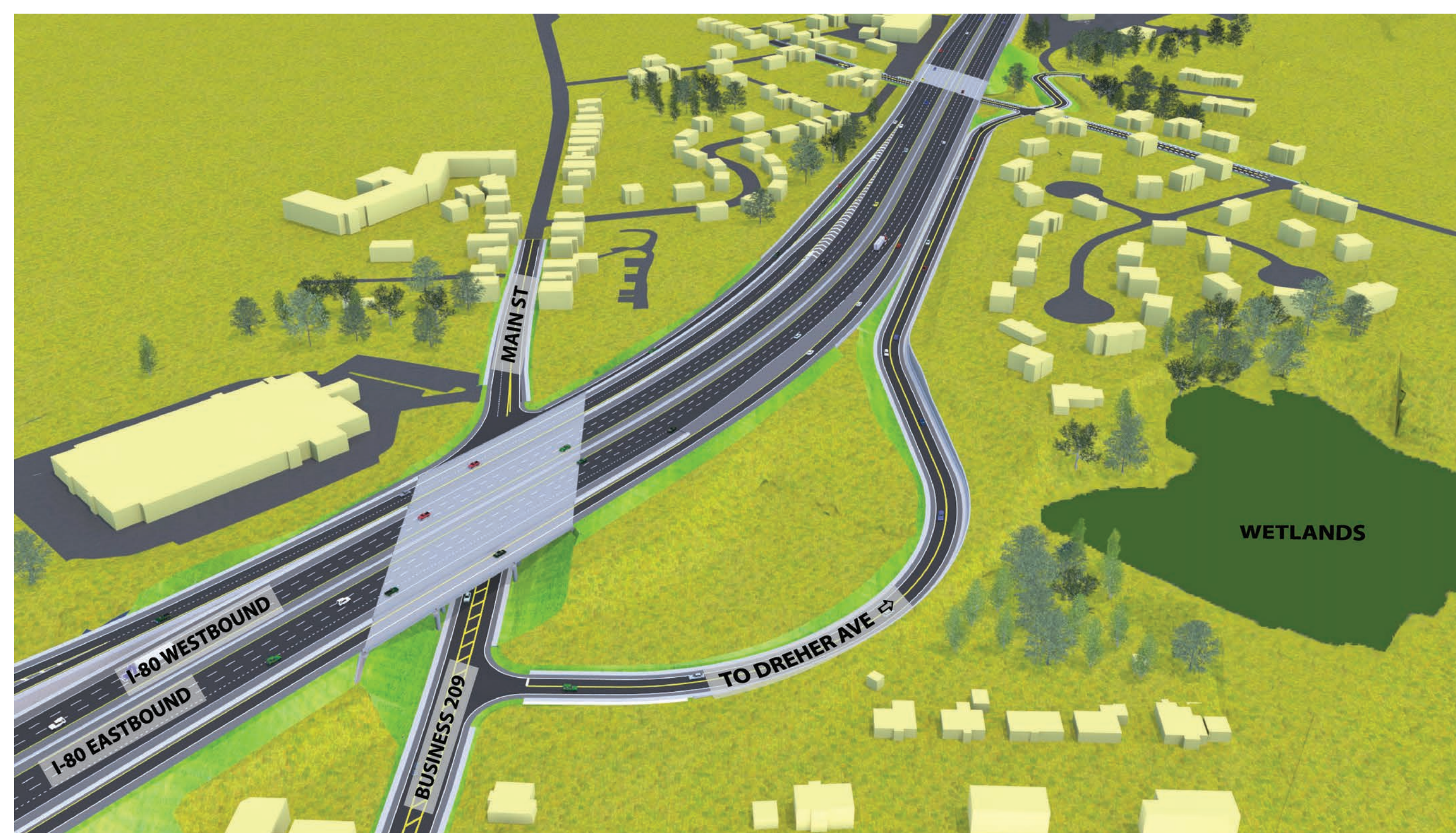
Looking East at the Proposed Dreher Avenue Connector