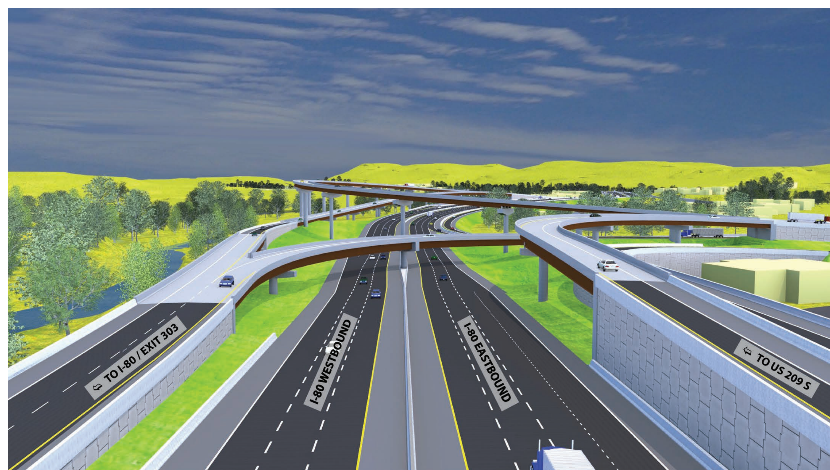
Looking East at the Proposed 304 Interchange