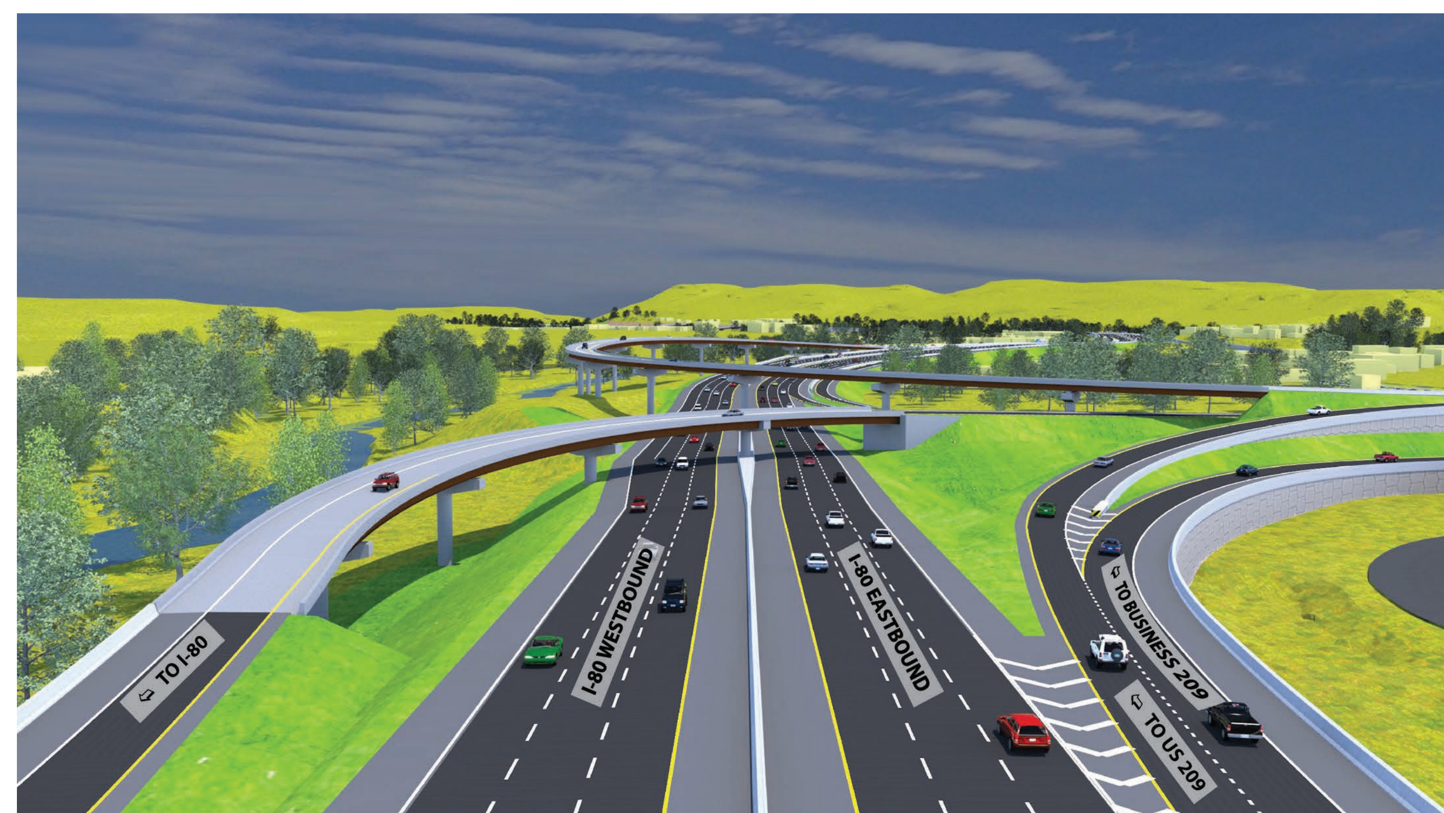
Looking East at the Proposed 304 Interchange