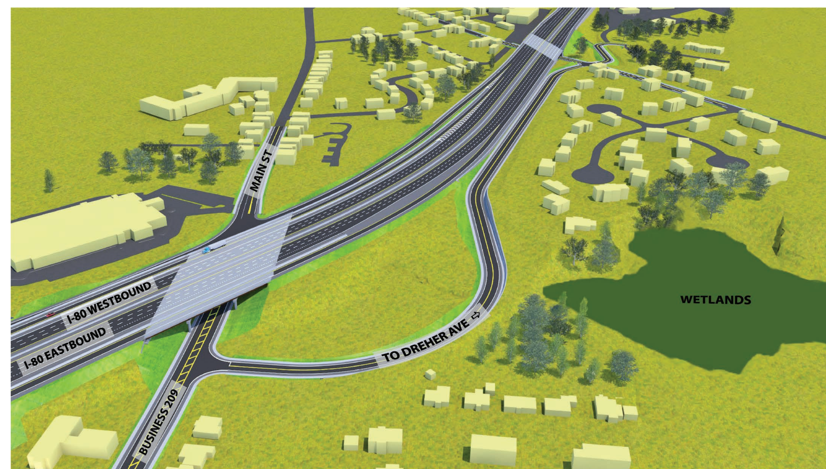
Looking East at the Proposed Dreher Avenue Connector